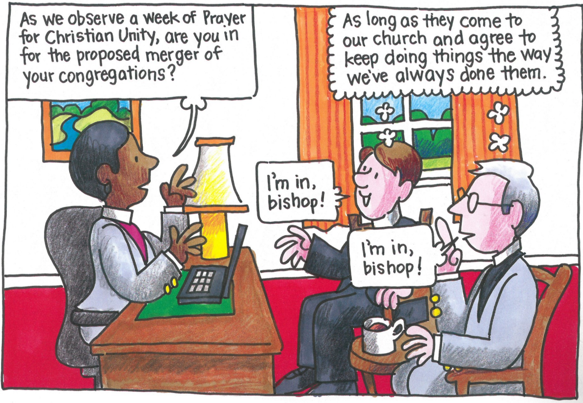
From the Church Pension Group 2024 Cartoon Calendar