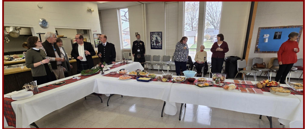
"We thank you for the Kirk of Christ, and the pattern of living to which we have been called in Him.